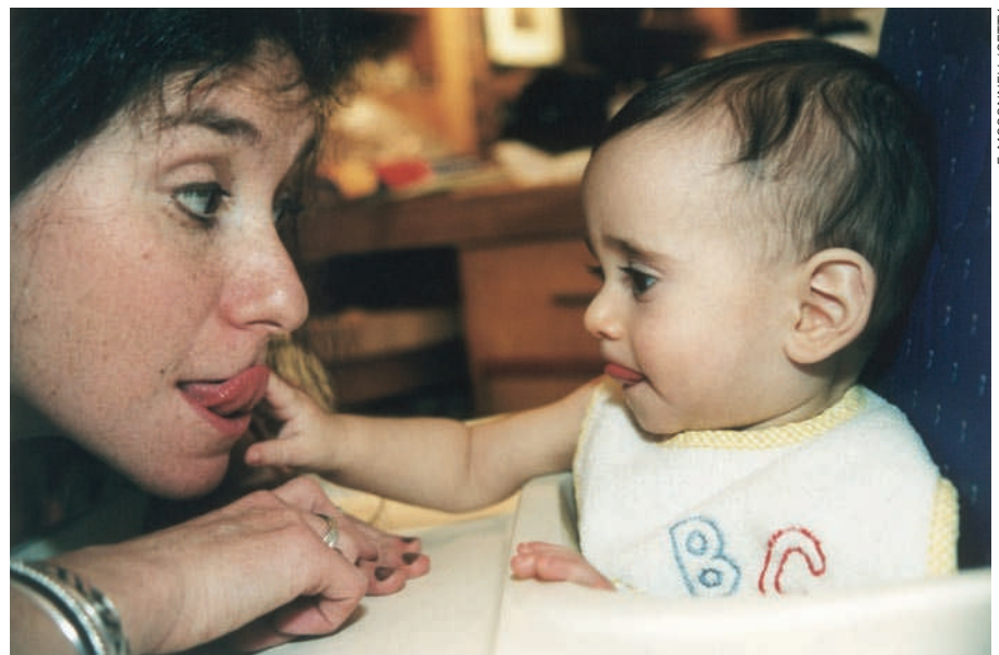
The early relationship between parent and child is crucial to later development.