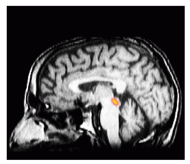
Figure 1 Brainstem activation (PAG) in the 10-20 Hz frequency band when the patient's stimulator was turned off.

particular must be considered with caution, given the unreliability with which our analysis can localise sources far below the cortex. When we threshold the activations at a t value of 2 (corresponding to a confidence interval of 95%), we found that the activation could be located at around 15 m left and right of the PAG but the peak is at the location we have listed in Table 1.